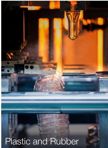
Plastic and Rubber